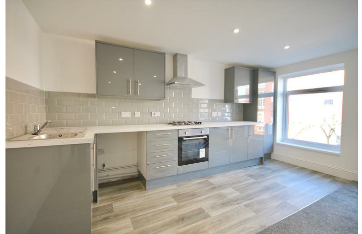
FIRST FLOOR 624 sq. ft. (58.0 sq. m.)